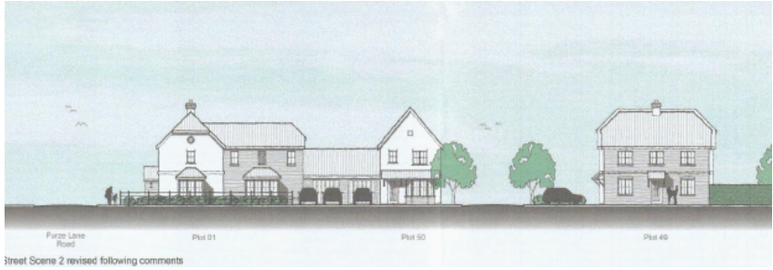
Street Scene 2 revised following comments