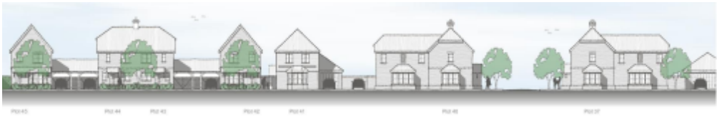
Street Scene 3: