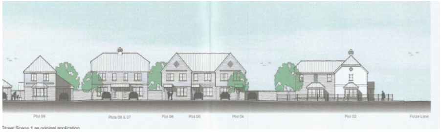
Street Scene 1 as original animation